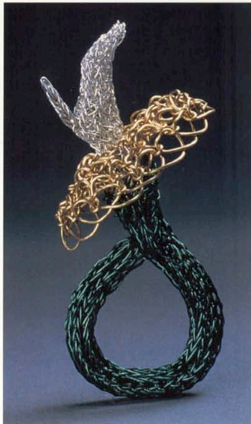
A ring by Barbara Stutman, called It's a girl! , uses fine silver, 22-karat gold, and magnet wire in a knitted construction. The green ring band is 28-gauge magnet wire double knit on a six prong spool; the leg is the same but in 28-gauge fine silver. The heel is woven in 26-gauge; the ankle and foot made with a crochet hook. The gold element is crocheted from the outer to the inner edge using diminishing sizes of hooks.