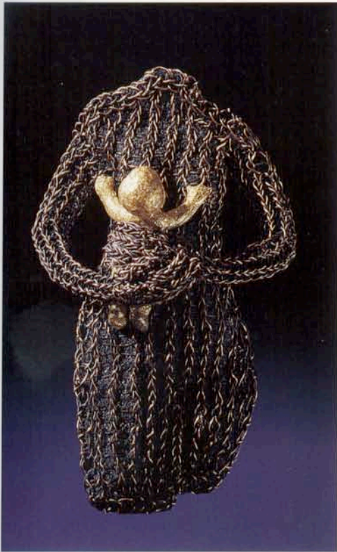
How to become a woman, Part 3 is a 4-1/4-inch (11 cm) high brooch by Barbara Stutman. It is knitted of 26-gauge copper wire using 2.25 mm needles, then sewn to a sheet metal backing of nickel silver. The arms are formed with a crochet hook on stitches picked up from the knitted torso. Polyurethane filter material is placed between the knitted form and the back sheet.